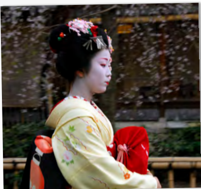
MAIKO IN KYOTO

It's not enough to simply go to Japan, take some photos and buy some souvenirs. It's about having unique moments and experiences that you can't forget. My goal isn't to just guide you around Japan and take a few photos, but instead, to create experiences that you will always remember and always miss once your trip is over. Experiencing Japan made my life better, and my aim is that along with my guidance, experiencing Japan will change your life as well.